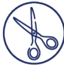
CUT & STRIP